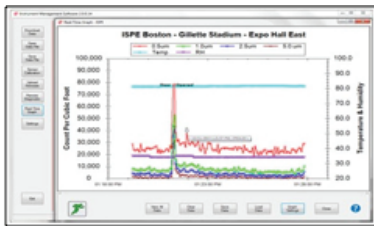
Control, monitor & graph from a remote PC