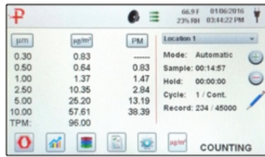
Simultaneous display of multiple PM Sizes