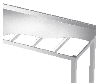
Table top with stainless steel stiffeners (max loading 120 kg uniform layout)