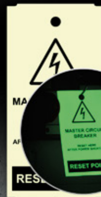
NEW! ReGLO Glow-in-the-Dark

PLUS! The SMS TAG-ID2 is ideal for all these industrial applications: