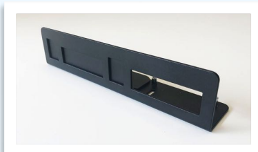
1 OR 2 RASPBERRY PI FOR 1 SLOT IN THE MAC MINI RACK MOUNT