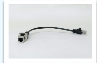
LAN CAT.6 CONNECTOR/INSERT WITH DETACHABLE CABLE