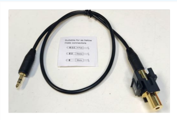
AUDIO CONNECTOR/INSERT WITH DETACHABLE CABLE