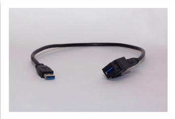
USB 3.0 CONNECTOR/INSERT WITH DETACHABLE CABLE