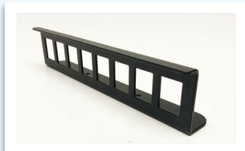
8-SLOTS I/O PANEL 1 ONE SLOT IN THE MAC MINI RACK MOUNT