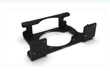
APPLE TV BRACKET FOR 1 SLOT IN THE MAC MINI RACK MOUNT