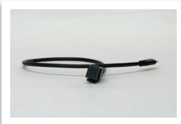
USB-C CONNECTOR/INSERT WITH DETACHABLE CABLE