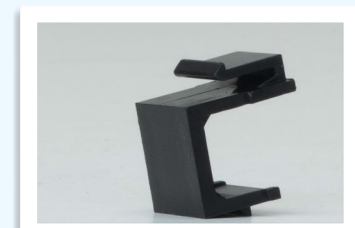
CONNECTOR SLOT BLIND PLATE / BLANK COVER