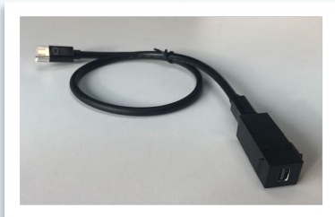
MINI DISPLAYPORT WITH DETACHABLE CABLE