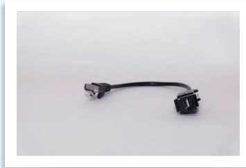
LAN CAT.5E CONNECTOR/INSERT WITH DETACHABLE CABLE