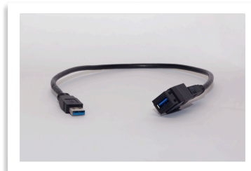
USB 3.0 CONNECTOR/INSERT WITH DETACHABLE CABLE Product number: 6517