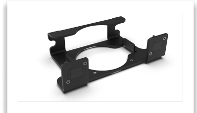
APPLE TV BRACKET IN THE MAC STUDIO RACK MOUNT Product number: 6699