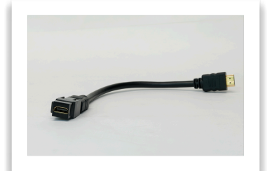
HDMI CONNECTOR/INSERT WITH DETACHABLE CABLE HDMI A > HDMI A Product number: 6564