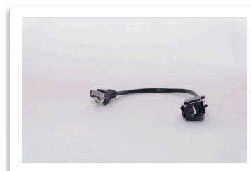
LAN CAT.5E CONNECTOR/INSERT WITH DETACHABLE CABLE Product number: 6516