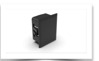
CONNECTOR SLOT BLIND PLATE / BLANK COVER Product number: 6885

* We offer the Mac Studio Rack Mount in two pre-configured options: