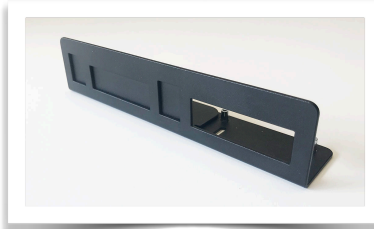
1 OR 2 RASPBERRY PI IN THE MAC STUDIO RACK MOUNT Product number: 6698