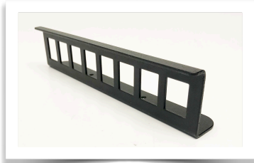
8-SLOTS I/O PANEL IN THE MAC STUDIO RACK MOUNT Product number: 6577