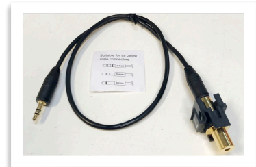
AUDIO CONNECTOR/INSERT WITH DETACHABLE CABLE Product number: 6568