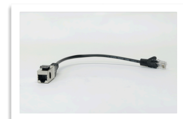
LAN CAT.6A CONNECTOR/INSERT WITH DETACHABLE CABLE Product number: 6563