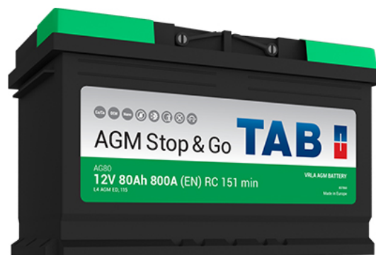
Base hold down