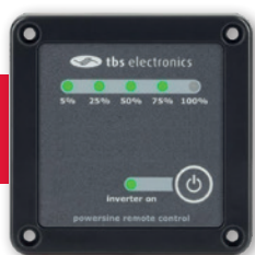
Basic Inverter Remote Control, art # 5095200