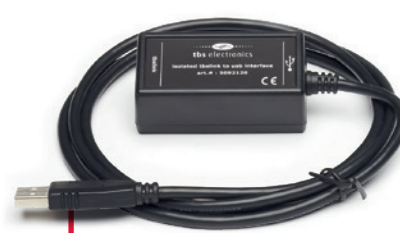
TBSLink to USB Interface Kit, art # 5092120 (Includes TBS Dashboard for monitoring the Powersine inverters)