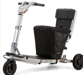
Carryall & Cushion