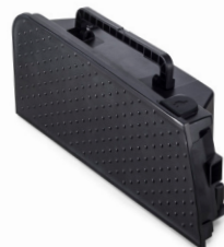
Standard Flight Battery