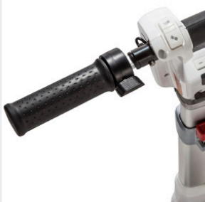
ATTO Left Hand Throttle Kit