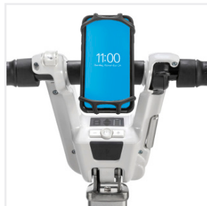
Mobile Phone Holder