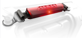
Rear Light Lifting Handle