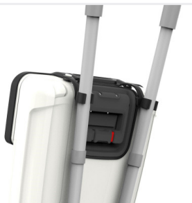
Cane / Crutches Holders