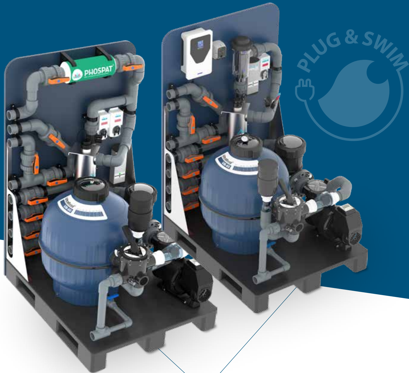
COMPLETE PLUG & SWIM PALLET FOR NATURAL POOL TYPE 4