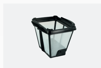
Simple 150-µ filter