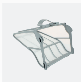
Filter canister Large-capacity rigid filter (5 litres)