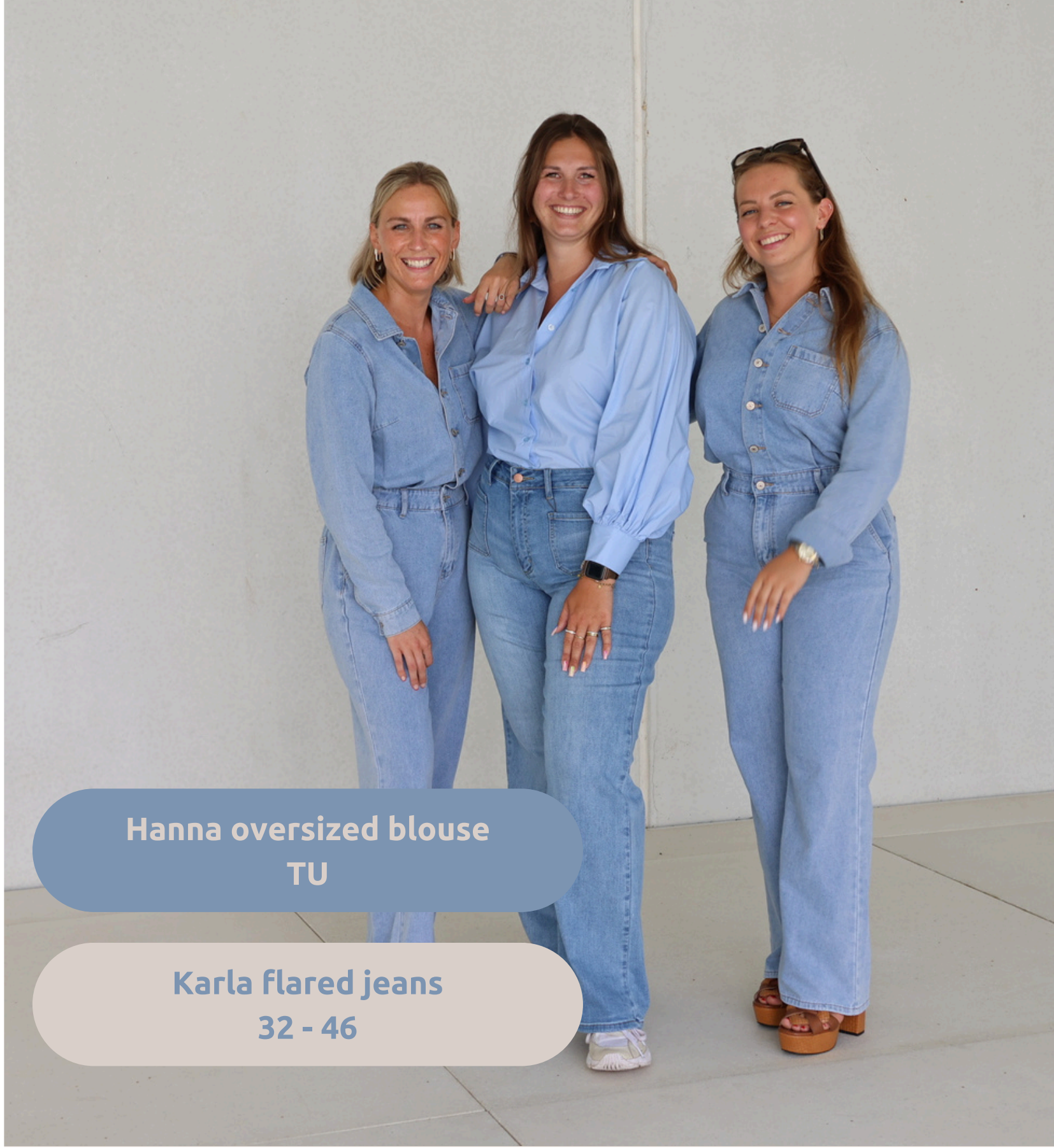
Hanna oversized blouse TU