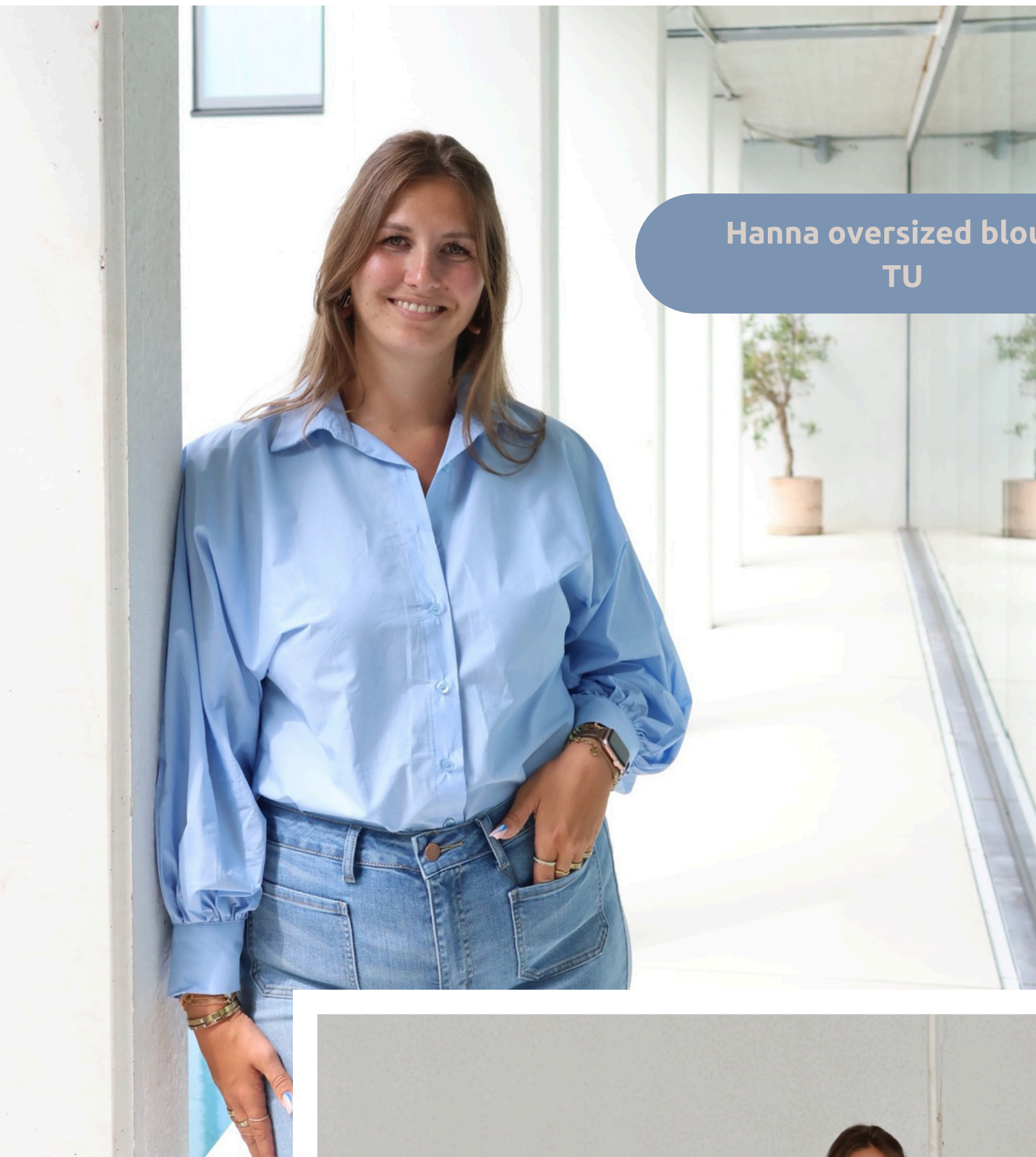
Hanna oversized blouse TU