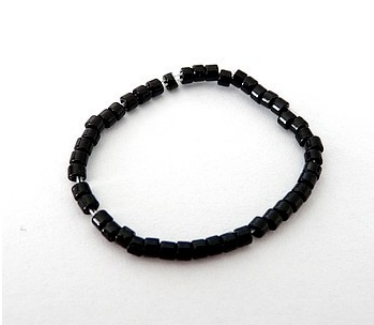
1) Pick up 46 DB and close