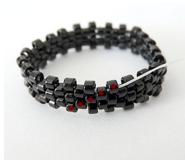
2) Bead 5 Peyote rows, go out like picture