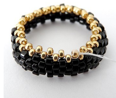
3) Bead 2 Peyote rows with R15