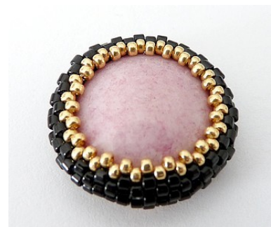
6) Bead 2 Peyote rows with R15, close your thread