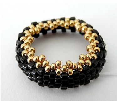
4) Bead 1 R15 row, by skipping a R15 (« Star set »)