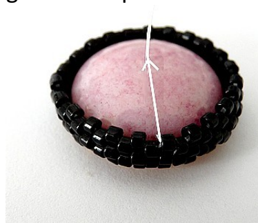
5) Turn work over, place your cabochon, go out like picture