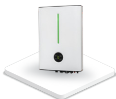
AC Coupled Inverter