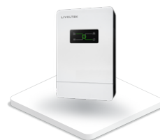
Off-grid Hybrid Inverter