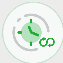
Long Cycle Life