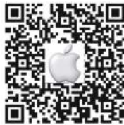
For Apple Device