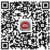
For Android Device