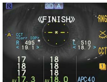
Patient's corrected IOP

By entering a patient's central corneal thickness, the operator can correct the patient's IOP. The IOP correction provides the correlation between the IOP and central corneal thickness, as LASIK patient's IOP changes between pre and post operation.