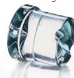
Ø 29 x H 34 mm

This product qualifies for the following listings: