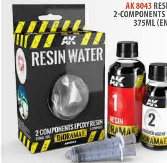
AK 8043 RESIN WATER 2-COMPONENTS EPOXY RESIN 375ML (ENAMEL)