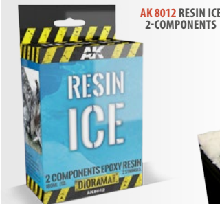
AK 8012 RESIN ICE 2-COMPONENTS

A low odor, 2 part component epoxy resin that simulates crystal clear water for miniature, dioramas, vignettes, etc. Can be used in other hobbies. It includes 2 syringes and instructions in the box. It does not shrink and nor leaves bubbles. High quality product completely transparent that can be thinned if desired. Mix resin and hardening agent in 2:1 ratio and let dry for 24 hours. Available in 375 and 180 ml.