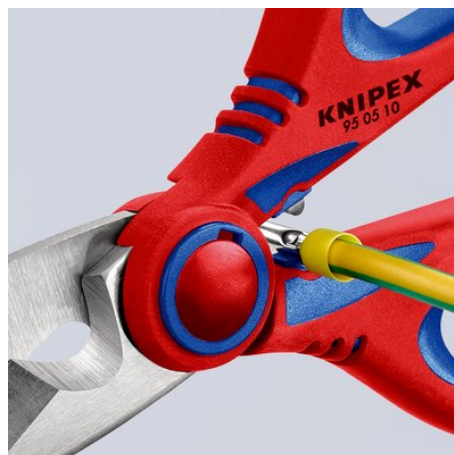
95 05 10 SB: Fast, easy crimping