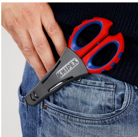
Securely stowed and always at hand