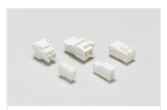
Rectangular Power Connectors(77)