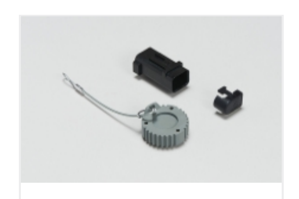
Automotive Connector Caps & Covers (19)