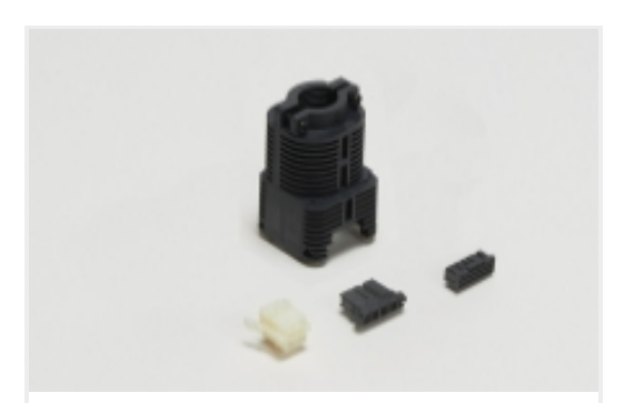
Rectangular Connector Housings(1)