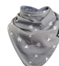
11319 Grey Arrows / Grey