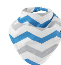
11312 Teal Chevron / Teal