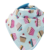
11304 Cupcakes / Teal