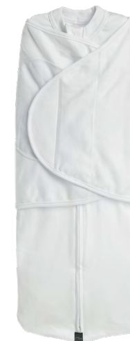
White 16111 Small 16211 Large