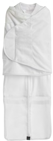
White 16411 Small 16511 Large