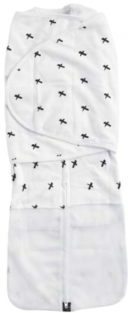
Black Criss-Cross 16016 Small 16717 Large

Small (7-14 lbs) and Large (15-22 lbs) All the great features of the original DreamSwaddle but with breathable mesh ventilation panels for warmer weather.