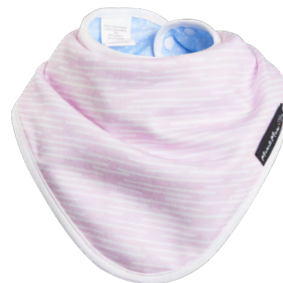
13244 Pink Dash / Cornflower Dot