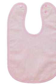
11202 Baby Pink