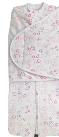
Pink Bubbles 16132 Small 16232 Large