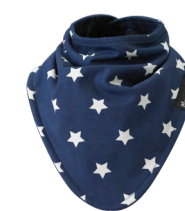
11316 Navy Stars / Navy