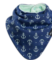
11318 Navy Anchor / Mint