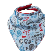
11302 Boy Print / Red