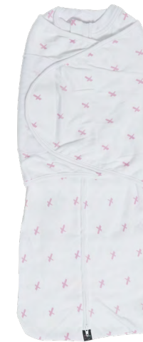
Pink Criss-Cross 16032 Small 16332 Large