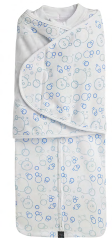
Blue Bubbles 16131 Small 16231 Large