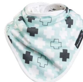
13243 Mint Plus / Crosses