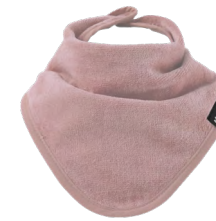
11418 Dusty Pink