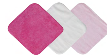
Cerise / White / Baby Pink