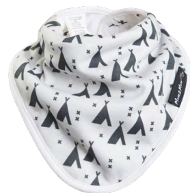
13242 Teepee / Crosses