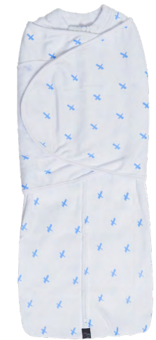
Blue Criss-Cross 16031 Small 16331 Large