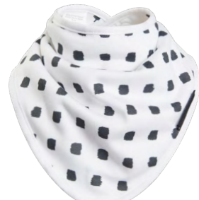
13247 Black Blocks / B&W Stars