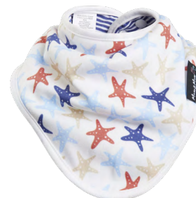
13240 Starfish / Blue White Stripe