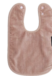
11218 Dusty Pink