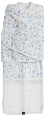
Blue Bubbles 16431 Small 16531 Large