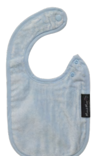
11101 Baby Blue