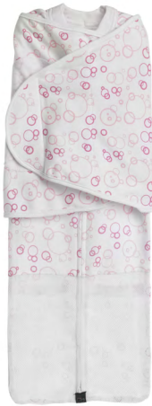
Pink Bubbles 16432 Small 16532 Large