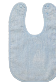
11201 Baby Blue