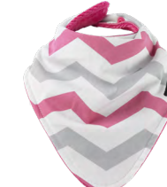
11309 Pink Chevron / Cerise