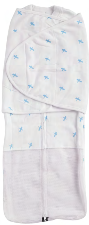
Blue Criss-Cross 16631 Small 16731 Large