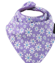
11310 Purple Daisies / Purple