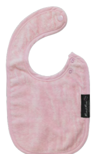
11102 Baby Pink