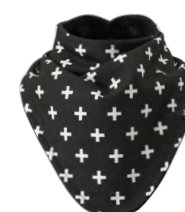
11317 Black Plus / Black