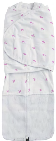
Pink Criss-Cross 16632 Small 16732 Large