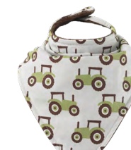
11313 Tractors / Chocolate