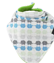
11305 Elephants / Lime