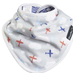
13241 Planes / Blue White Stripe