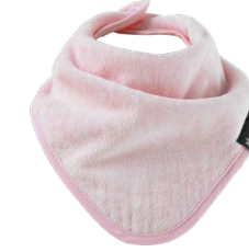
11401 Baby Pink