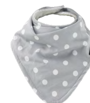
11307 Grey Dots / White