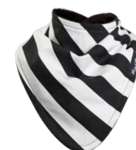
11320 Black White Stripes / Black