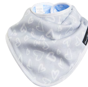
13245 Grey Hearts / Cornflower Dot