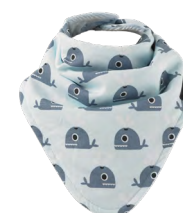
11314 Whales / Baby Blue