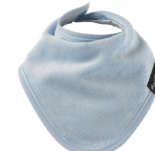
11401 Baby Blue