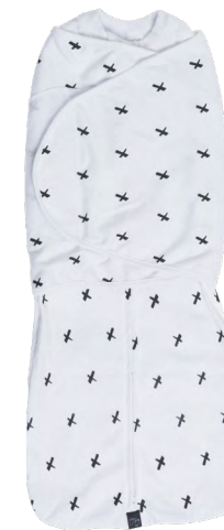
Black Criss-Cross 16016 Small 16317 Large