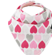
11308 Muted Hearts / Baby Pink