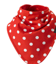
11315 Red Dots / Red