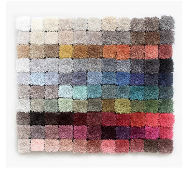
Possibilty to create your own mix color out of 110 uni colors.