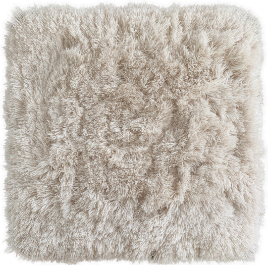
Super Moon 45