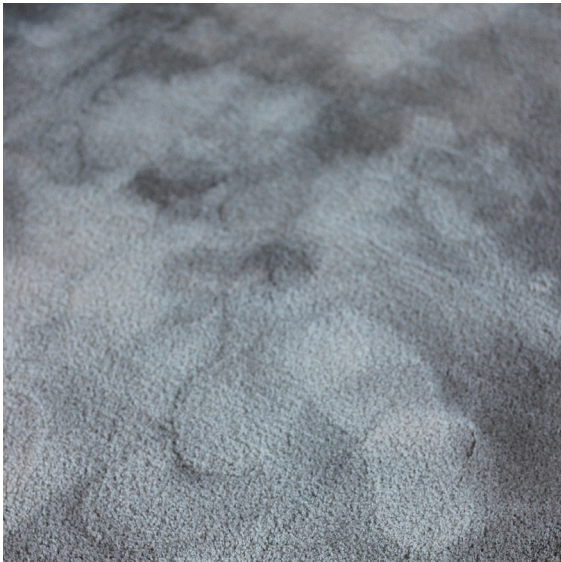
Super Moon 18