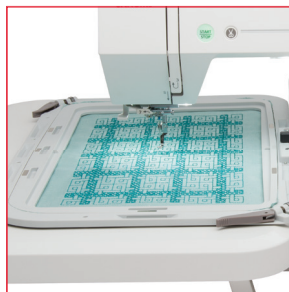
Maximum Embroidery Size: 7.9" x 14"