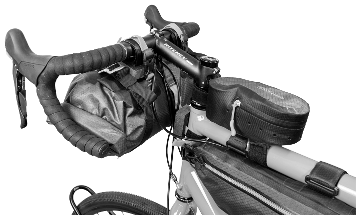
Example: Cockpit-Pack mounted to frame (Frame-Pack and Handlebar-Pack not included)

Goldmedal Best of 2018 World of MTB (Germany), 2018