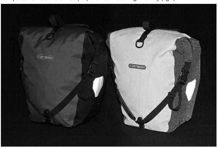
The entire material of front, back and sides reflects light

Comparison of Back-Roller Plus (left) and Back-Roller High Visibility (right)