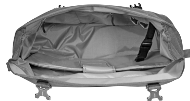
Inside: padded laptop sleeve