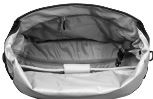
Notebook sleeve for laptops (dimensions 27cm x 40cm x 3cm / 10.6in. x 15.7 in. x 1.2 in)