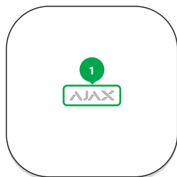
1 - Logo with a light indicator