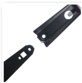
• (Fig 1) - Click Lock

To take apart, simply reverse the operation by releasing the spring clips (click lock) and pulling up the back from under the wings one lock at a time-or pull out the swivel arms (swivel lock) and pull the back up from under the wings.