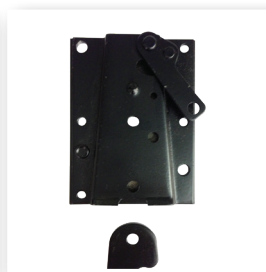
• (Fig 2) - Swivel Lock