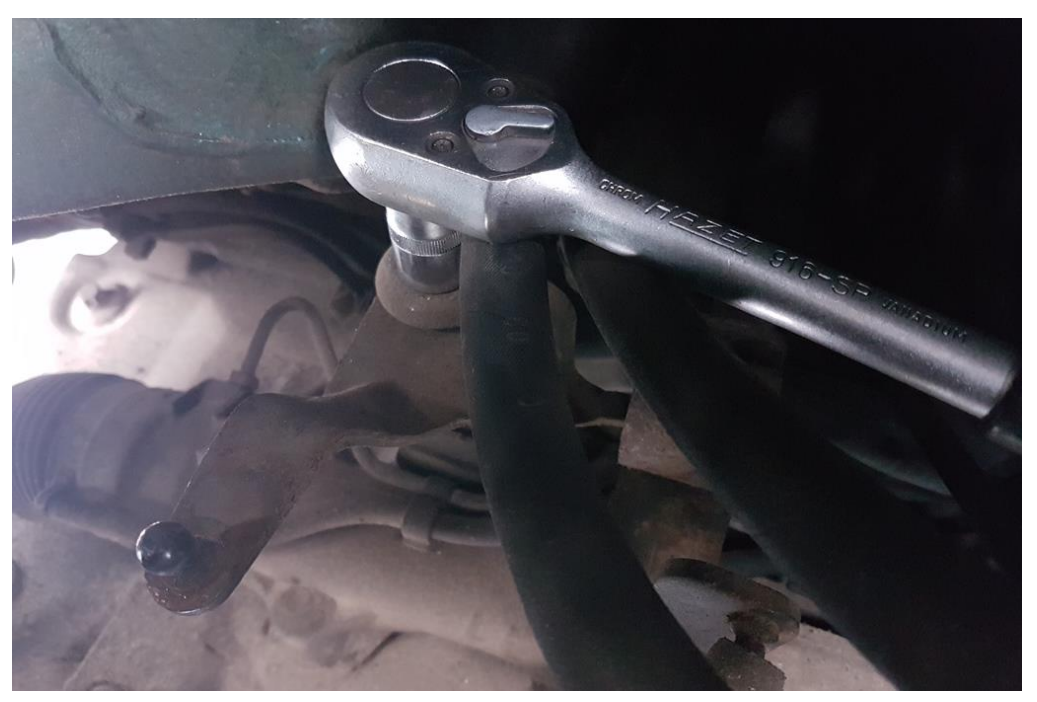
Unscrew the bolt which holds the OEM shifter. (use 16mm spanner) Remove shifter arm and undo it from all components.