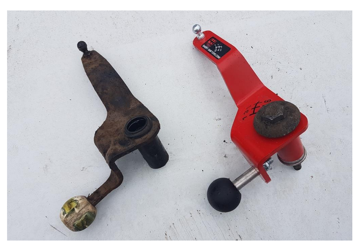
Fit all parts on the new 4H-TECH shifter arm.