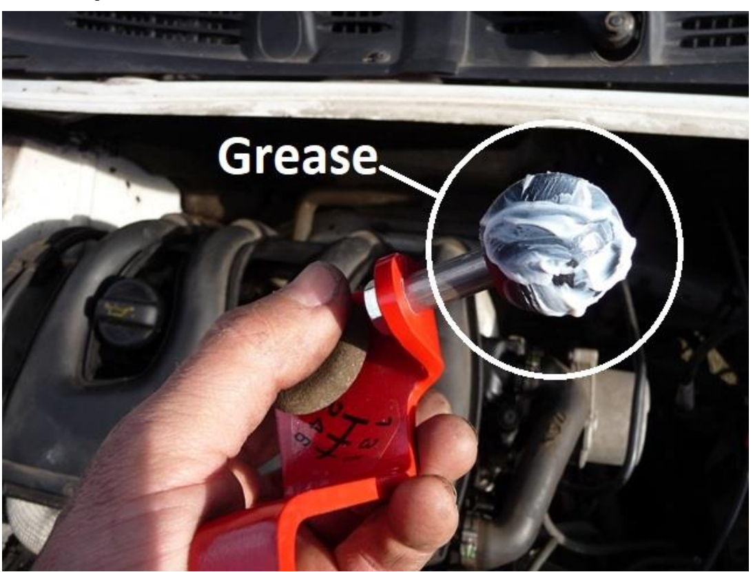
Grease up the new shifter joint, and fit it to the shift mechanism in the engine bay.