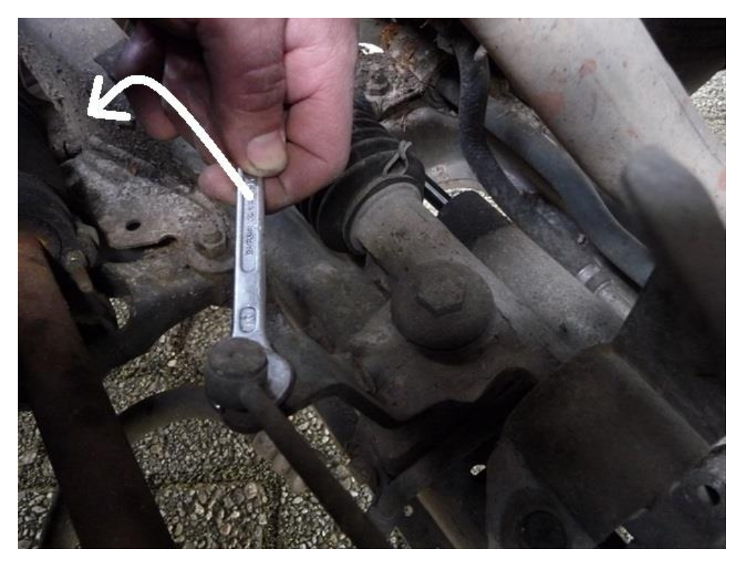
Use a 10mm spanner to unclip the shift bar from the bolt head.