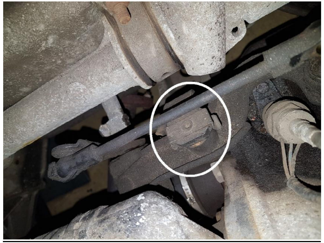
Remove central linkage pin.