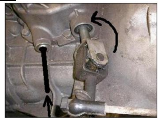
Stick drill of 5mm into the hole and turn to lock.