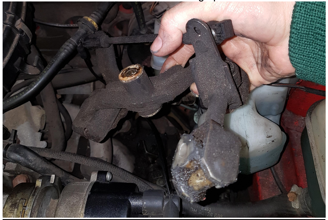
Remove standard shift mechanism