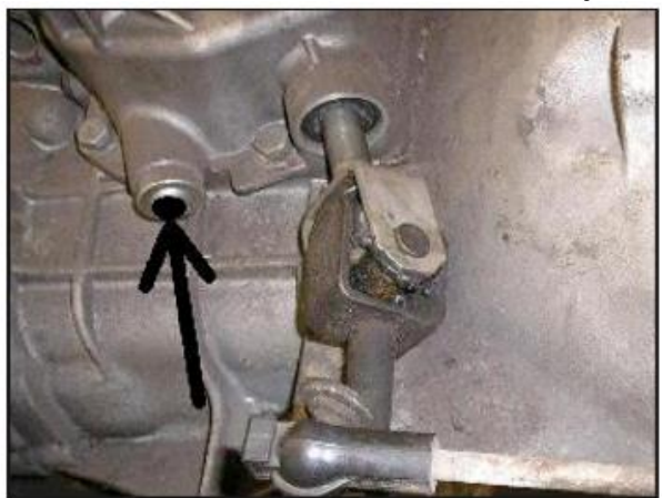
Remove black plastic plug from gearbox.