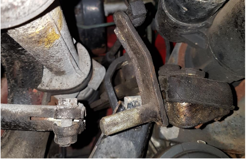
Losen the bolt from the shift bar

Remove pin between gearbox and shift mechanism