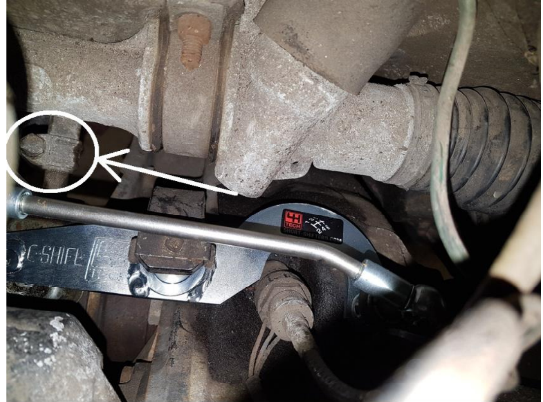
Put the new shifter back in the car. Fit everything in reverse order, but wait with tightening the bolt which connects the shifter with the shift leaver bar.

Dong forget to secure the new top shifter bar with the new pins, like shown on this picture. Put the pins in the little holes of the bolt head, and secure them by turning them over the bolt head. (click)