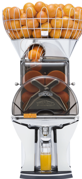
Fantastic F/D Programmable fruit quantity Fantastic F/SB Self-service

Combine high-tech with pure efficiency – the fully automatic machine for medium to high juice demand.