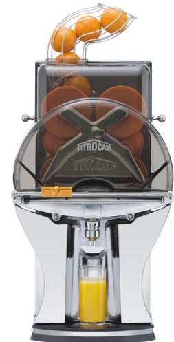
Fantastic M/AS Automatic start Fantastic M/SB Self-service

Performance meets ease-of-use – the smart juicer with manual feeding for medium juice demand.