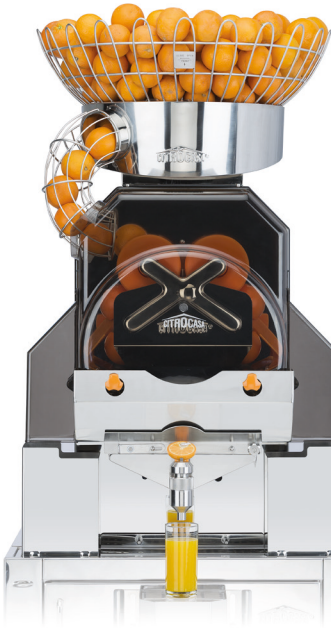
8000 XB Programmable, 5l juicetank 8000 SB ATS Self-service, Automatic sieve cleaning 8000 SB ATS POMEGRANATE Self-service, Automatic sieve cleaning

High efficiency and proven reliability – the strongest and fastest juicer for the best performance.