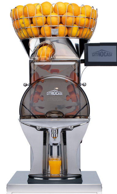
Fantastic eXpress OneStep-Cleaning Fantastic Connect OneStep-Cleaning, network compatible

Lift the premium juicing standard up to new heights – the newest technology of self-service juicers.