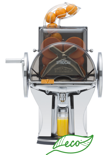
Starlight Entry level juicer Fantastic Eco Self-service Fantastic Eco Plus Self-service, Automatic feeding

Self-sufficiency and Innovation – the manually operated juicer, providing sustainability and independence.