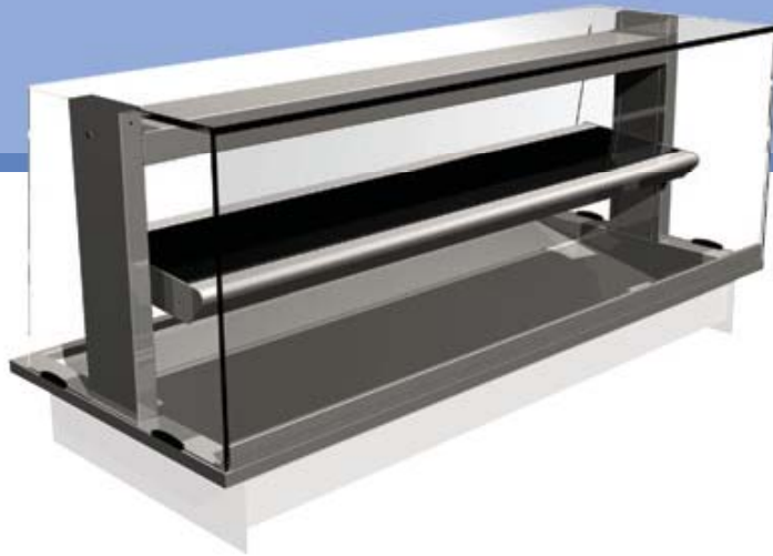
VISUAL SHOWS THE MHDL4-GO DISPLAY