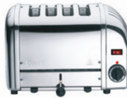
Polished Bun 4 Slot 43021