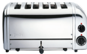
Polished Bun 6 Slot 61019