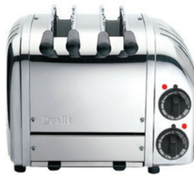
2 Slot Sandwich Polished 21056