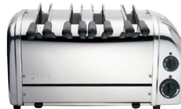
4 Slot Sandwich Polished 41036