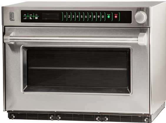
Model MSO5351 shown