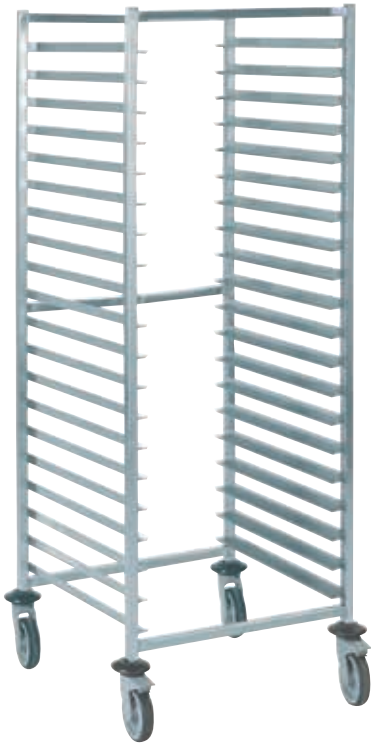
Pastry trolley, 600 mm opening