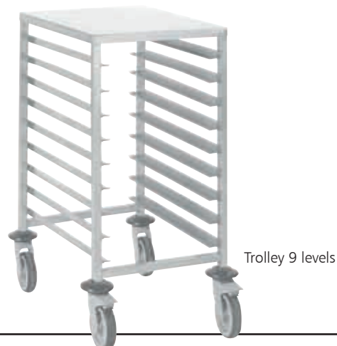
Trolley 9 levels