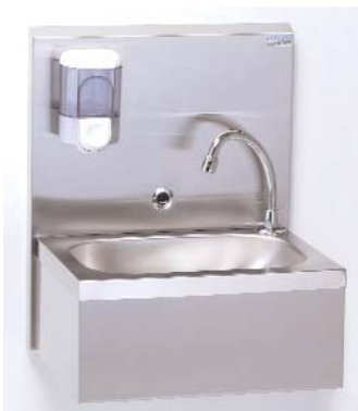
Ref.: 806 387

All these wash basins have knee-actuated controls, and the tap is turned on by pressing the paddle located on the front panel.