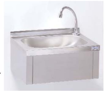
Ref. 806 381

The range of Tournus GC wash basins now includes 6 models for 6 different ways to equip your kitchen.