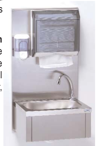
Ref.: 806 385

NEW - the GC wash basin with 790 mm high splash back: this has all the advantages of the previous model, while the higher splash back brings the additional possibility of fixing a paper towel dispenser, capacity 250 towels.