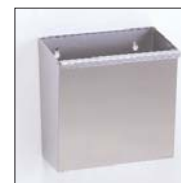
Ref.: 806 395