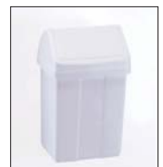
Ref.: 806 396