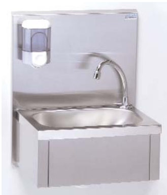
Ref.: 806 383

- the simple GC wash basin: the bowl, with apron around 3 sides and a 29 mm rim at the back, fixes to the wall with screws.