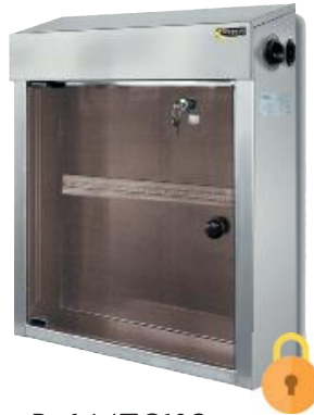
Ref. MZC10S Ref with UK plug. MZCA10S