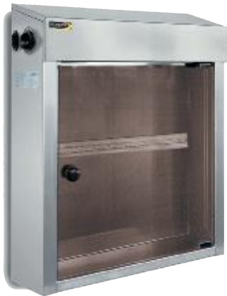
Ref. MZC10 Ref with UK plug. MZA10