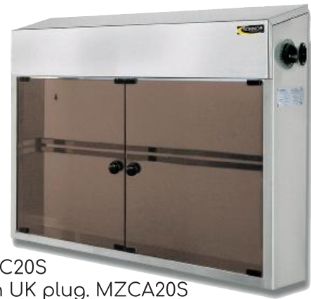
Ref. MZC20S Ref with UK plug. MZCA20S

15 Knives / 15 W light 580 x 150 x 646 mm