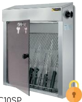
Ref. MZC10SP Ref UK plug. MZCA10SP