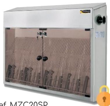
Ref. MZC20SP Ref UK plug. MZCA20SP

25 Knives / 15 W light 580 x 150 x 646 mm