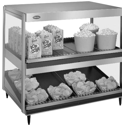
Model GRSDS/H-36D with slant base and horizontal top shelf and optional 15" (381 mm) clearance top shelf