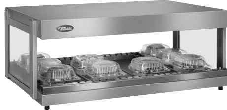
Model GRSDH-30 horizontal single shelf

Equipment On Signage Program Hatcographics.com