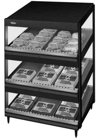
Model GRSDS-24T triple slant shelf in optional Designer black