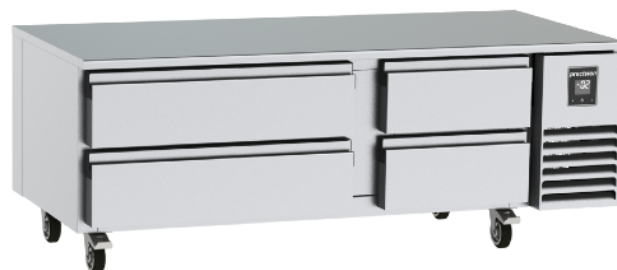
Centrally Positioned Evaporator Place Between Drawer Sets For Even Internal Temperature Distribution

Proudly made in the UK, these robust counters are capable of meeting the highest demands of commercial kitchens all around the world.