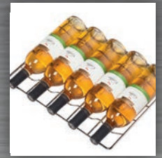
Optional wine shelves available