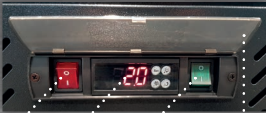
Power On / OFF switch Temperature display Light switch Protective cover