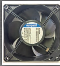
Energy saving EC fans from German brand leader EBM Papst