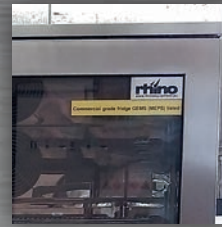
304 grade one piece stainless steel door frames with no visible mitre joints