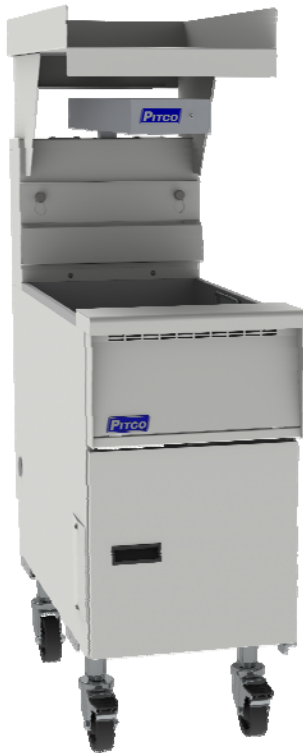
SGBNB18 with optional food warmer, top shelf and casters

To be used with the Solstice Fryer line. Unit can be installed on either side or between fryer(s). Design to match existing or accompanying fryers. Pan area allows for holding and draining of finished product. Drain screen easily lifts out for cleaning. Bottom Shelf provides ample storage for breading, batter, food utensils, etc. *Bottom Shelf is not provided when a filter pump or flush hose is located inside the dump station.