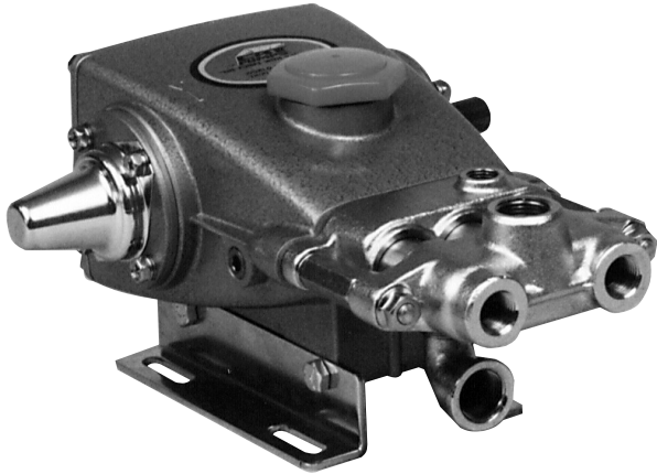
(Rails and Shaft Protector sold separately)