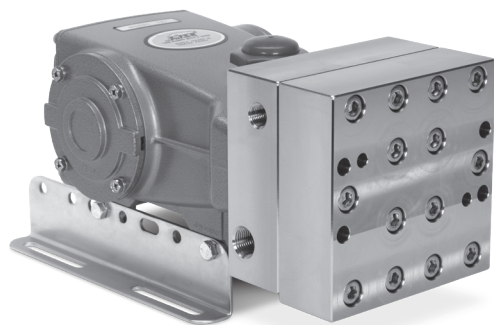
Model 781 Shown (Mounting rails sold separately)