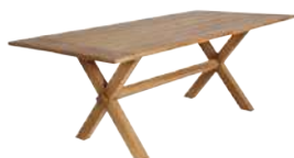
COLONIAL TABLE 9475U - L200 D100 H72,5