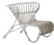
FOX VB - E22 - DO W80 H64 D80 SH25