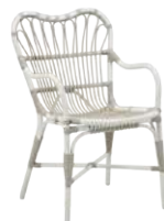
MARGRETE SD - E103 - DO W53 H88 D40 SH45