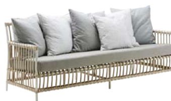
CAROLINE SD - E326 - DO L197 H82 D82 SH42