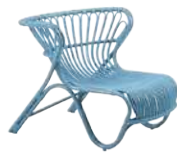
FOX VB - E22 - BU W80 H64 D80 SH25