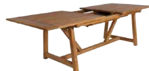
GEORGE EXT. TABLE 9480U - L200 (280) D100 H72,5