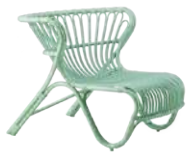
FOX VB - E22 - MT W80 H64 D80 SH25