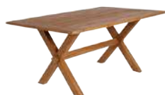
COLONIAL TABLE 9460U - L160 D100 H72,5