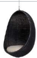
HANGING EGG CHAIR ND - E85 - BLK W85 H125 D75 SH45