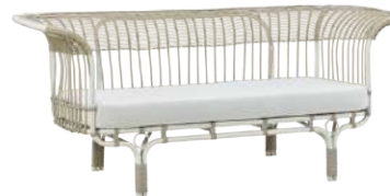
BELLADONNA FA - E90 - DO W195 H78 D75 SH31