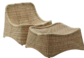
CHILL - ND - E25 - NAT CHAIR: W69 H55 D75 SH17 STOOL: W69 H33 D69 SH17