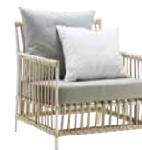
CAROLINE SD - E126 - DO W70 H82 D82 SH42