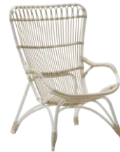
MONET CHAIR SD - E182 - DO W67 H98 D81 SH40