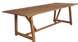
GEORGE TABLE 9440U - L240 H72,5 D100