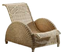
PARIS AJ - E33 - NAT W68 H83 D102 SH34