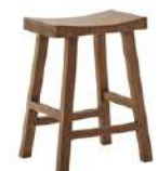
CHARLES COUNTER STOOL 1054D - W50 H68 D40 SH66

Our teak items are made from old recollected teakwood, such as old houses, old fisher boats or old rail road supports. The wood will appear with reparations and fillings. When used outside our teak will turn into a beautiful silvery grey colour.