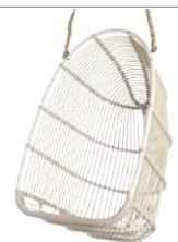
RENOIR SWING SD - E380 - DO W75 D68 H113