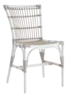
ELISABETH SD - E109 - DO W44 H81 D40 SH45