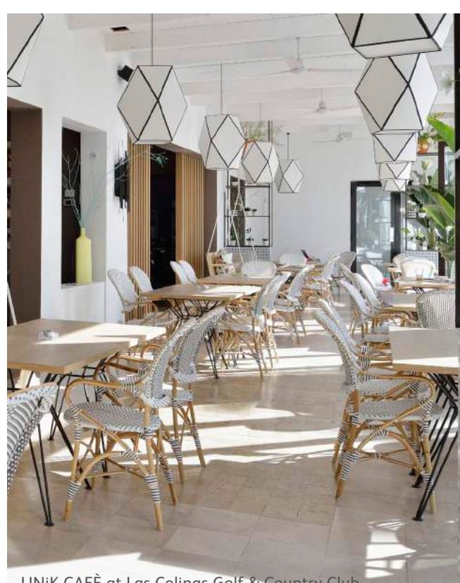
UNIK CAFÈ at Las Colinas Golf & Country Club