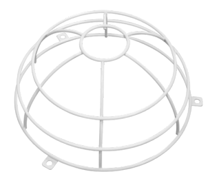
Wire basket BSK (Ø 200 x 90 mm) Art.No: 92199

Detection area: horizontal 360° (Ceiling mounting) Range: max. Ø 24 m across<br/>br>max. &Oslash; 8 m towards<br/>br>max. &Oslash; 6.4 m seated Monitored area (tangential movement): 450 m² / 2.5 m mounting height