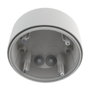
SM socle mounting set IP54 PD4N H Art.No: 93465

Dimensions: Ø 110 x 45 mm Degree / class of protection: IP54 Material color: white, similar to RAL9010