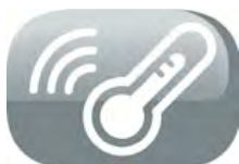
Room temperature thermistor