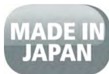
Made in Japan