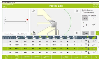
This function automatically calculates bending sequence, analyses possible collisions and provides information in graphic display for the operator.